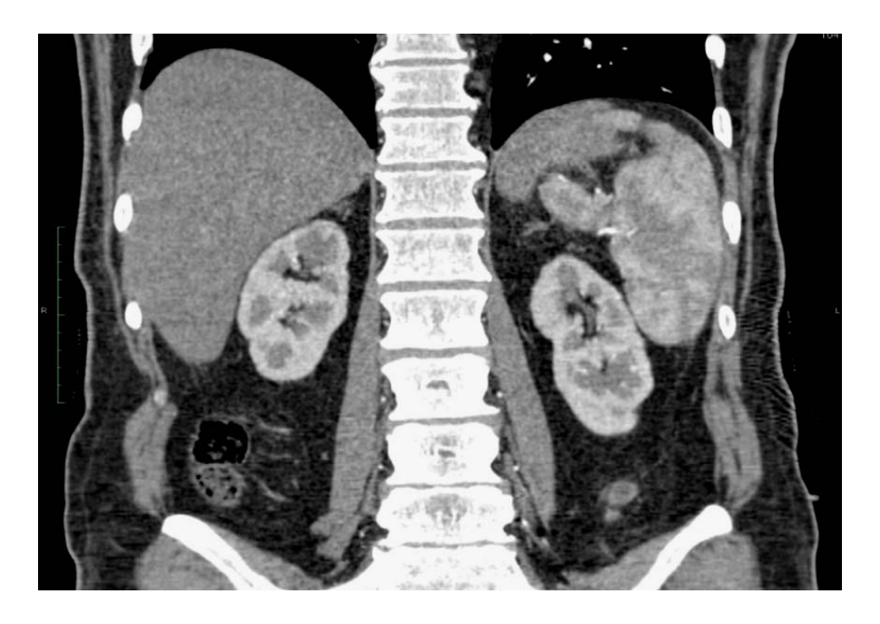
Fig. 2. Contrast enhanced computed tomography, frontal projection, determination of the third lumbar vertebra body