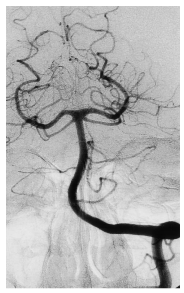
Fig 3. Follow-up angiogram obtained 6 months after stent placement shows an absence of filling of the aneurysm, normal patency of the VA and BA, and no evidence of intimal hyperplasia or concomitant vessel stenosis.

dovascular treatment in some clinical situations (eg, small curvature of the cerebral vasculature, absence of side branches on the stented segment or the possibility to sacrifice them). Future technical developments will likely improve stent-graft design and offer more sophisticated delivery systems. The long-term follow-up results of stent-graft placement, especially in cerebral vessels, are still unknown and should be studied in clinical trials.