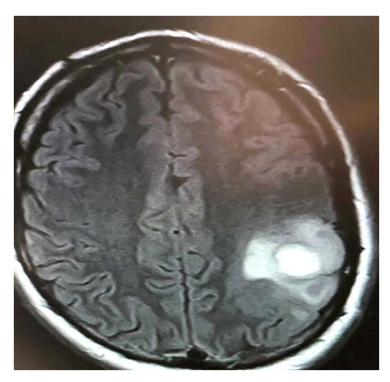
Fig. 1. MRI of a supratentorial primary tumor of the frontal localization on the left

In all patients, primary supratentorial intracerebral tumors of the frontal, temporal and parietal localization were diagnosed and verified by magnetic resonance or computer tomography (Fig. 1). The histological structure of the tumors was verified by examination of the surgical material.