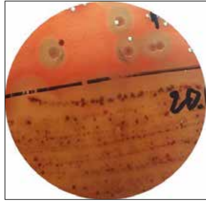
Fig. 3. Wild-type Staphylococcus aureus produces a zone of \beta -hemolysis on blood agar, against the light, 24 h