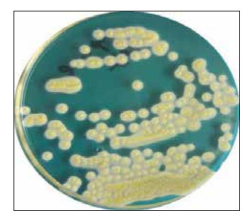
Fig. 2. Wild-type Staphylococcus aureus produces typical colonies with zones of lecithovitelase activity on yolk-salt agar, 18 h.

The median of the growth retardation zone for cefoxitin for isolates with a normal phenotype (n = 50) was 30 (95%)