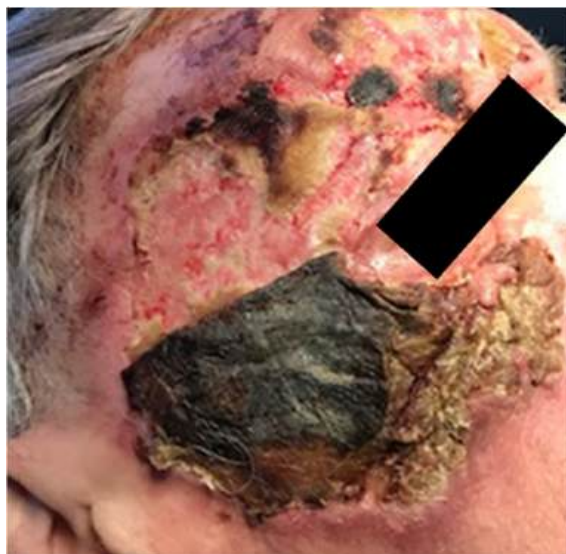
Fig. 5. Local state on day 5 after necrectomy