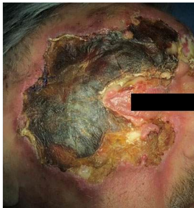
Fig. 3. Extensive eroded surface covered with necrotic masses

The next day, the swelling practically disappeared and an extensive eroded surface appeared, which in 2 days became covered with necrotic masses (Fig. 3).