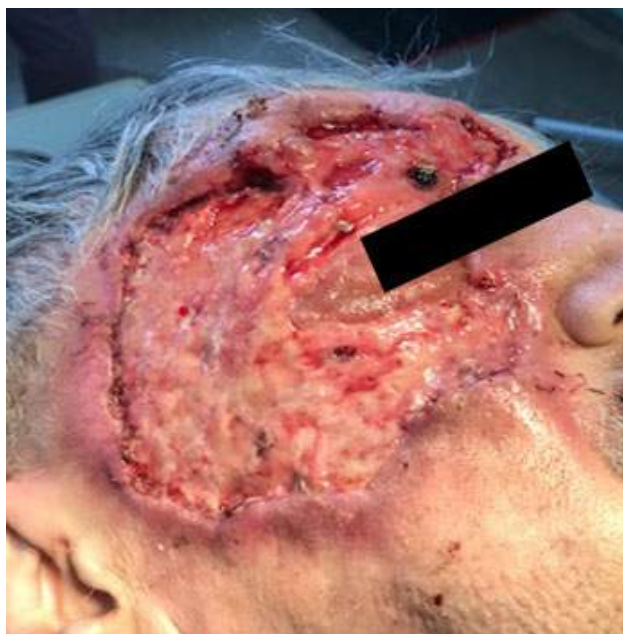
Fig. 6. Condition of the postoperative wound on day 1 after surgery

Given the positive dynamics of the healing process, the second stage of necrectomy was performed on day 6 after the first stage. The condition of the postoperative wound on the first day after the operation is presented in Fig. 6.